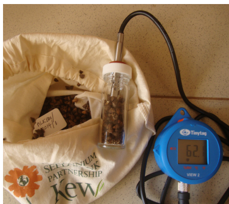
Figure 2: A data logger used with a probe to measure seed eRH within a sealed container.