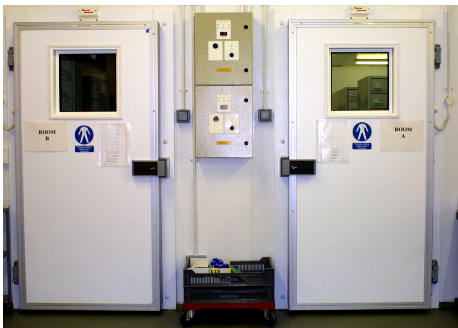
Figure 1: -20°C seed storage rooms.

To calculate the room volume required, start with the sizes of containers to be used (see Box 1). Choose different containers for collections of very small, medium and large volume ( Technical Information Sheet 06 ).