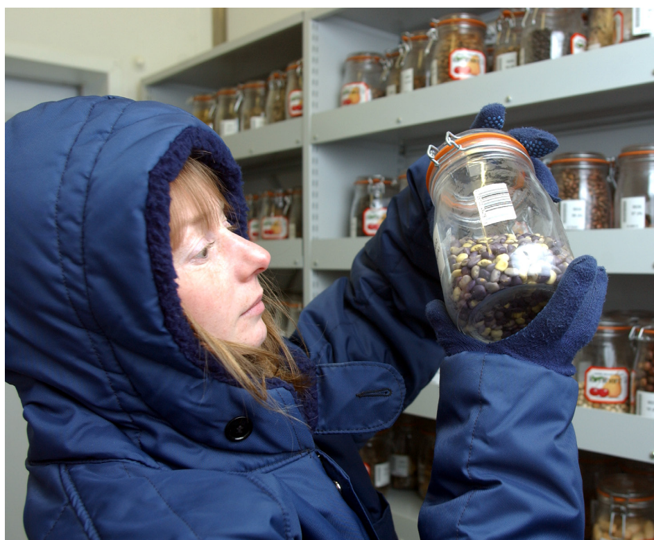
Figure 3: MSBP staff member wearing regulation cold room clothing.