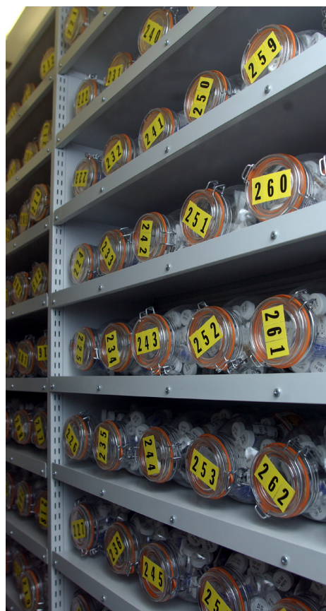
Figure 2: Seed collections 'double-packed' in a cold room - approximately thirty 30cm 3 universal bottles fit into each 3 litre preserving jar.

Having estimated the floor area required, mark it out on the ground to get a feel for what the room might look like. Consider allocating space adjacent to the cold room for potential future expansion due to unforeseen demands.