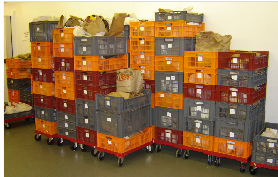
Below: Crates stacked on moveable trolleys in the MSB dry room, with seed collections contained in porous bags