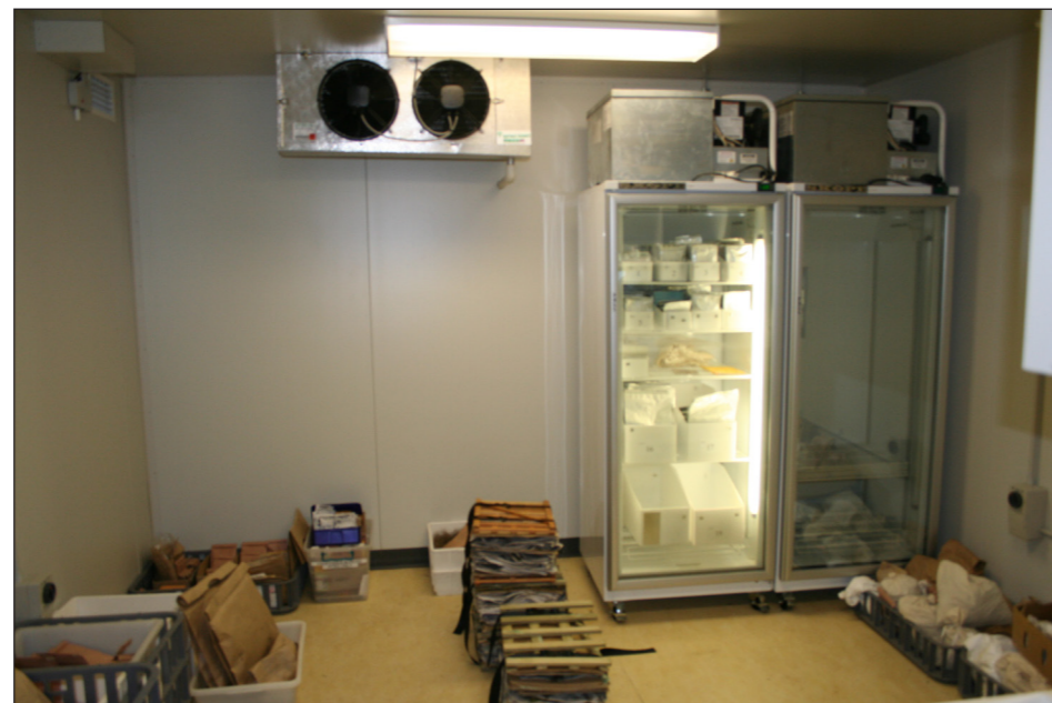
Below: Tasmanian Seed Conservation Centre, Australia - dry room with sorption dryer unit and -20°C chiller cabinets for seed storage

The supply of fresh air can be shut off when there is sufficient oxygen in the room. This is controlled via a carbon dioxide monitoring device, linked to an automated fresh air intake valve in the process air duct. Seek further technical advice if this