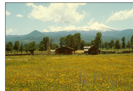
Above: Assessing the extent of a population

Detailed analysis of the partitioning of genetic diversity within the species would be necessary to confirm the actual extent of the population.