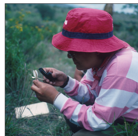
Below: Plant identification in the field

The most difficult moment for a seed collector is often deciding whether a population meets the minimum quality and quantity standards for seed sampling for a particular purpose or project. This information sheet provides guidelines and a tool - the pre-collection checklist - to help collectors carry out that assessment and ensure that seed collections arriving at the seed bank have the highest possible initial viability and are of sufficient quantity for long-term conservation. Refer to Technical Information Sheet_03 in this series for further details on Seed Collecting Techniques .