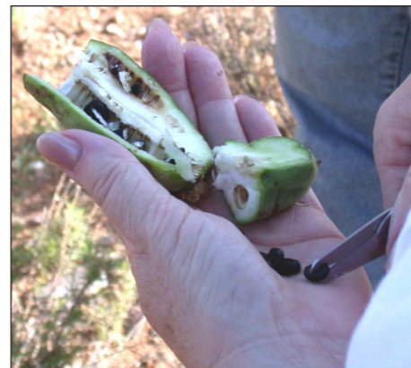
Below: Evaluation of Yucca seeds by cut-test

In the case of rare and threatened species, aim to collect a minimum of 500 seeds, always taking into account the 20% rule (see Setting a safe limit to seed collecting overleaf). Multi-year collecting and/or propagation may be necessary to achieve a good-sized seed collection for such species.